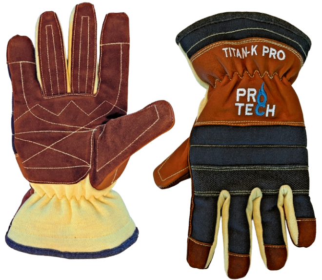
Short Cuff: Model # PT8-TNKSC

Palm Layers and Fingers Stitched Down with High-Burst Kevlar® Thread to Strengthen Grip